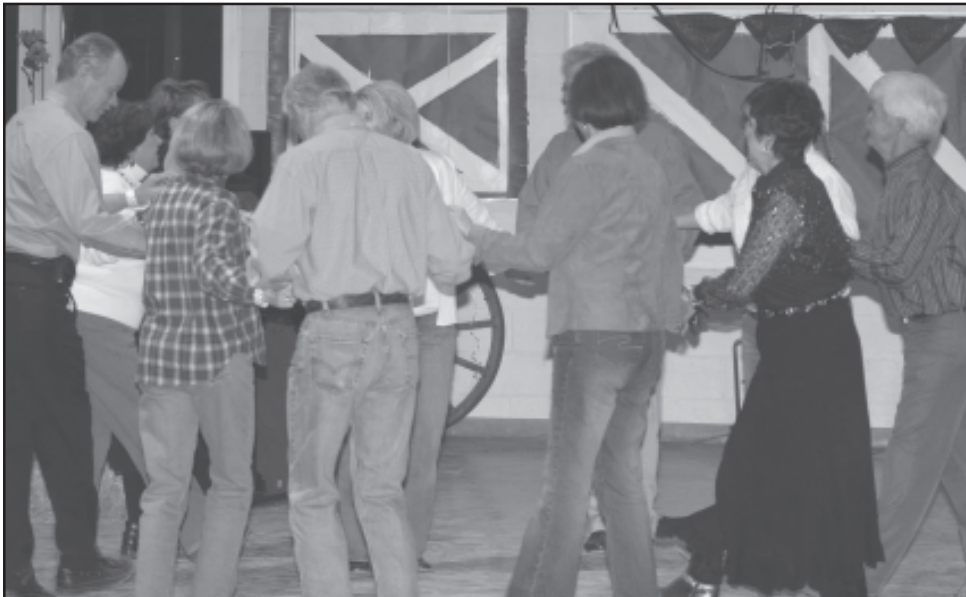
BARN BLAST PARTICIPANTS TAKE TO THE DANCE FLOOR